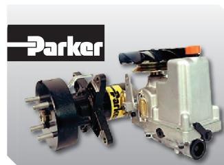
Parker® HTE - Smooth steering and 1,000 hour oil change intervals