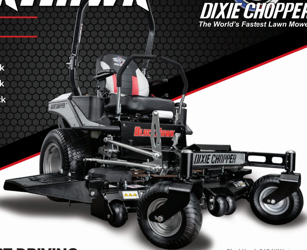
BlackHawk 2454KW shown