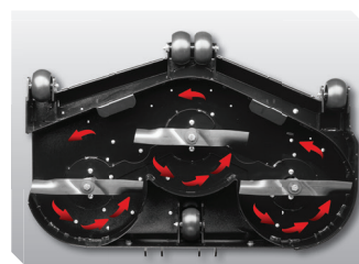
48", 54", and 60" Decks - Deep 7 gauge shell to tackle deep grass