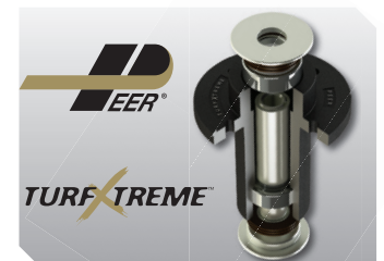
PEER® Spindles - Maintenance free with Contamination Exclusion Technology