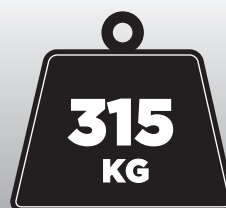
Heavy Loads - Get more work done with 315+ kilograms of operating capacity