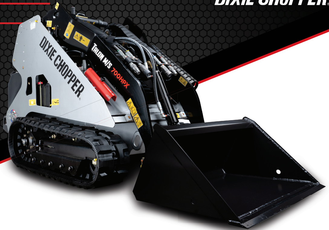
Talon M/S 700HPX shown